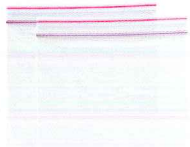
Food Storage Bags