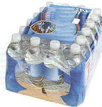
Case Wrap (e.g. snacks, beverage cases)