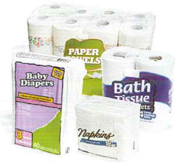
Napkin, Paper Towel, Bathroom Tissue and Diaper Wrap (packaging)